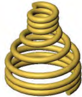
Fig. 1: Drawing of 3C-2.4

Material: \text{Ø}0.18 W1.4310 Finish: 2\mu Ni, 0.5\mu Au